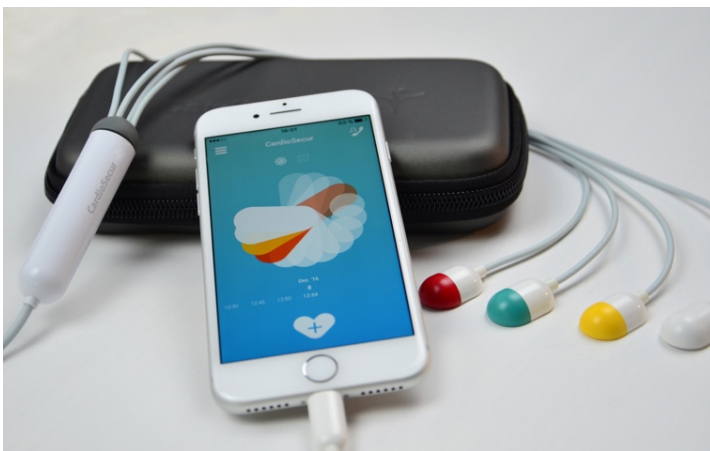
CardioSecur Active for iPhone

Personal MedSystems GmbH develops and sells ECG systems and services for private users and healthcare professionals under the name CardioSecur. CardioSecur Active is an innovative, 15-lead, clinical-grade ECG for personal use. In a few seconds, it generates personalized feedback regarding changes in the heart's health and provides a simple recommendation to act regarding whether to see a doctor or not. The entire system consists of a 50g light cable with four electrodes, the complimentary CardioSecur Active App and the user's smartphone or tablet. CardioSecur Pro is the mobile, clinical ECG solution for physicians and medical professionals. CardioSecur Pro operates based upon guidelines from the European Society of Cardiology by providing 22 leads, making a 360° view of the heart possible. It is the only system that thereby recognizes infarctions of the anterior, lateral and posterior walls of the heart.