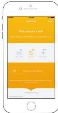
Minor ECG changes