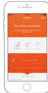
Significant ECG changes