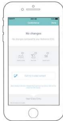
No ECG changes

Based on a personalized ECG comparison, you will receive one of 3 possible recommendations for action after just 20 seconds . No matter where you are, you will immediately know whether you require medical attention. Keep an eye on your heart at all times – even when you're not connected to the internet.