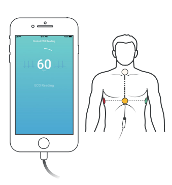
Attach cable Start ECG recording