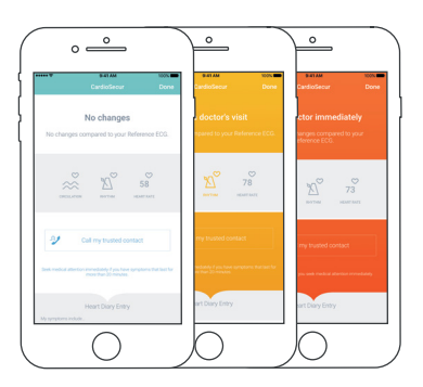
Receive recommendation to act within 20 seconds